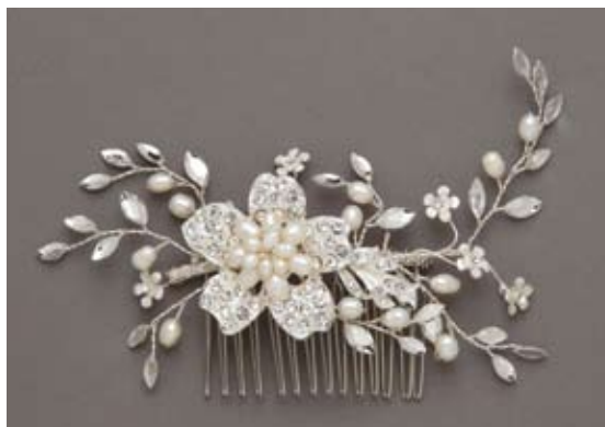
Silver floral spray comb accented with freshwater pearls and crystals, from David's Bridal

hair decoration. While Baumer created the tiara especially for Charlene, brides without a royal budget and