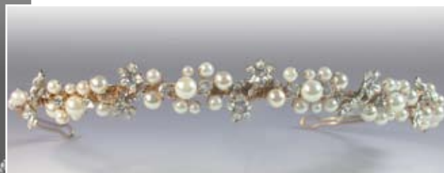
Peaked crystal tiara with silvertone setting and side combs, left, and floral-inspired tiara of Austrian crystals, rhinestones and pearls, both from Princess Bride Tiaras.

bands for a more formal, tiara-style feel.”