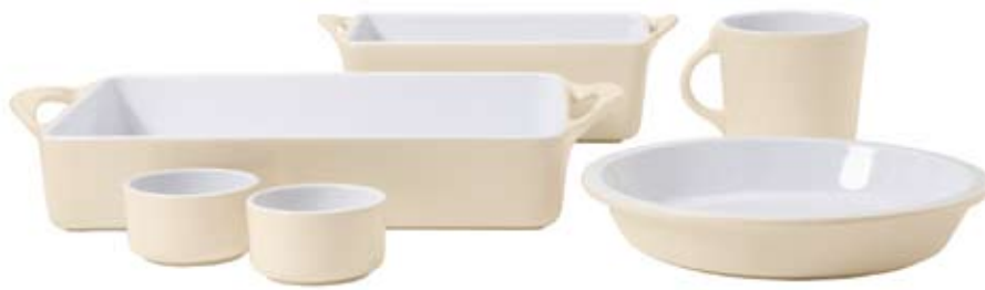
Giada De Laurentiis for Target 6-piece ceramic bakeware set, $49.95

scanner are quick to zap the knife block with the most handles sticking out of it. They should be doing the opposite.