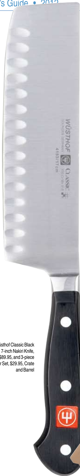
Wüsthof Classic Black 7-inch Nakiri Knife, $89.95, and 3-piece Starter Set, $29.95, Crate and Barrel