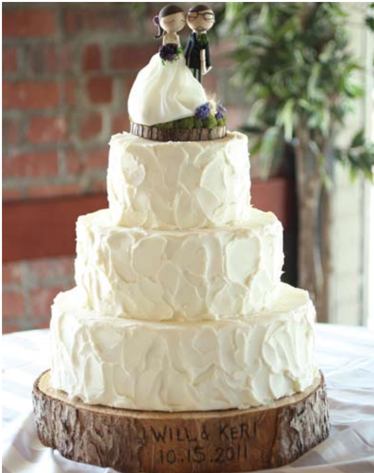
A Cake to Remember

Sure, towering tiers of woven fondant blooming with hand-formed sugar flowers and topped with a chocolate diorama of the city where you live make for quite a spectacle, but they can also take up a sizeable portion of your wedding budget. Instead, consider opting for a simple or “rustic chic” design and make the actual cake - what’s inside - the star of your big-day dessert. By focusing on fantastic flavor instead of over-the-top flair, not only will you save money, you’ll have a nice cake that you actually want to eat it, too.