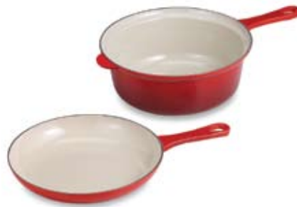
Le Creuset 2-in-1 pan, $209.99, Bed Bath & Beyond

for two reasons. One, the name adds an assurance of quality (Giada DeLaurentiis says this pan is awesome!). Two, it gets you excited to use it (I'm going to go braise some beef like Mario Batali!). In addition, going back to mul-