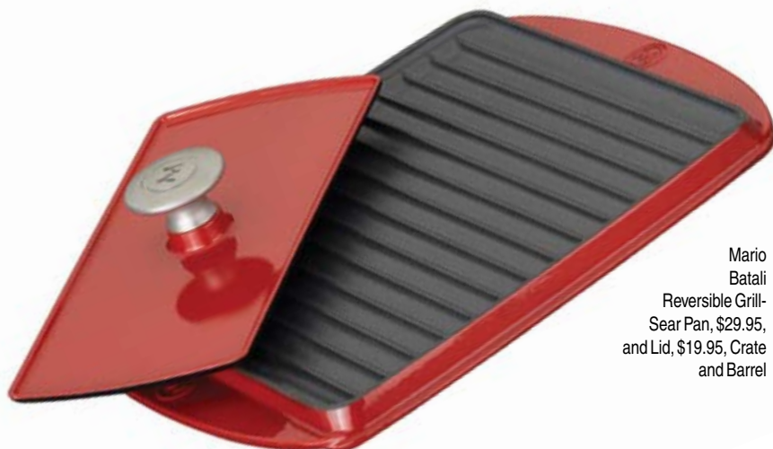
Mario Batali Reversible Grill-Sear Pan, $29.95, and Lid, $19.95, Crate and Barrel