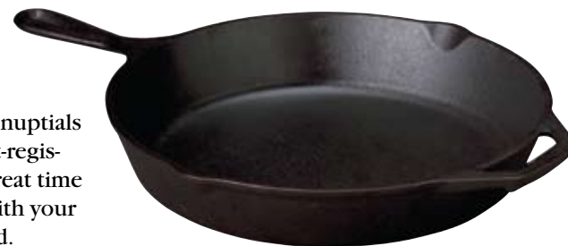
Lodge 12-inch cast iron skillet, $27.95, Crate and Barrel

Together, the Le Creuset 2-in-1 Pan is a 2-quart lidded saucepan; separately, it’s a saucepan and frying pan. The enameled cast iron design offers great heat retention and long-lasting wear protection, so you’ll have plenty of years of soups and pasta sauces, or fried eggs and stir fry, depending on how you use it. Of course, the smart design means it takes up minimal cup-