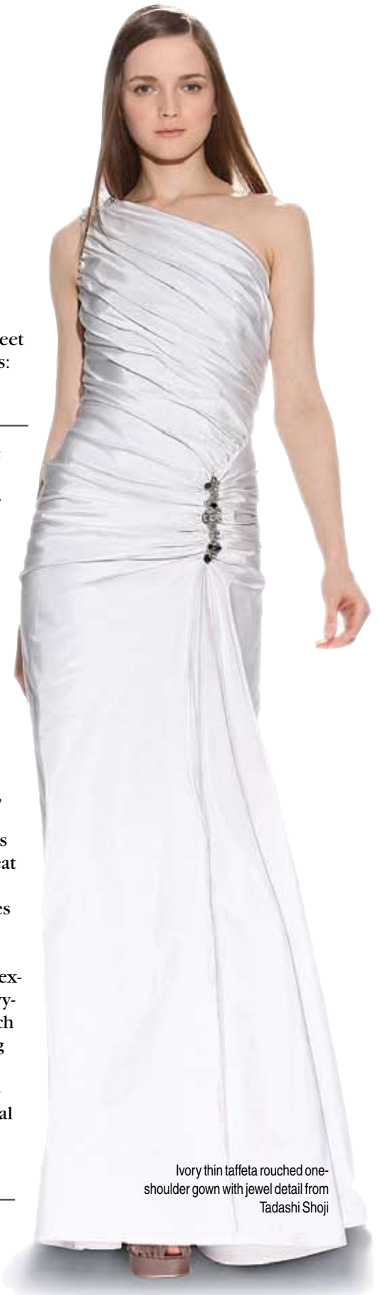
Ivory thin taffeta rouched one-shoulder gown with jewel detail from Tadashi Shoji

Chiffon – With a see-through quality, this elegant fabric gives with a slight stretch and crepe-like texture. Available in