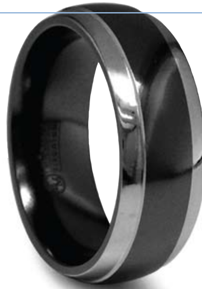
BlackTi band from Edward Mirell

The price of an ounce of gold has climbed during the past years of economic turmoil, rising by some 28 percent in the first nine months of 2011.