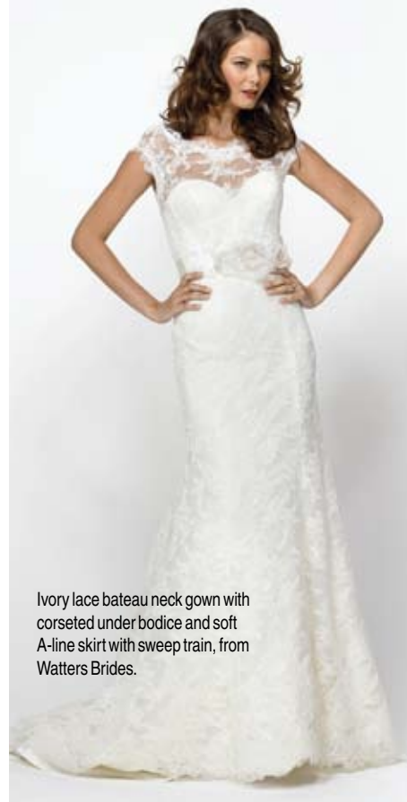
Ivory lace bateau neck gown with corseted under bodice and soft A-line skirt with sweep train, from Watters Brides.